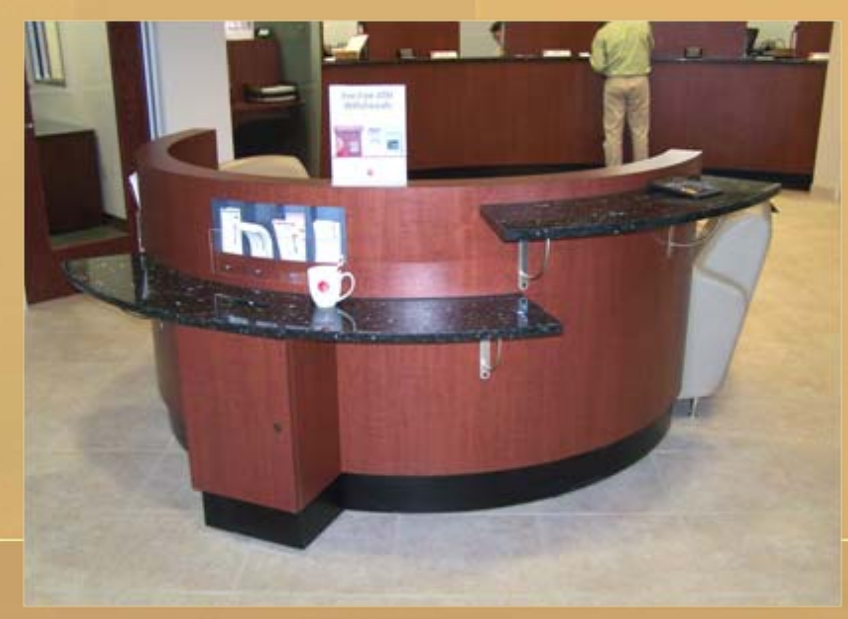
Check Stand and brochure display

High pressure laminate wood tones, combined with granite tops, metal brackets and glass panels result is a modern and durable product.