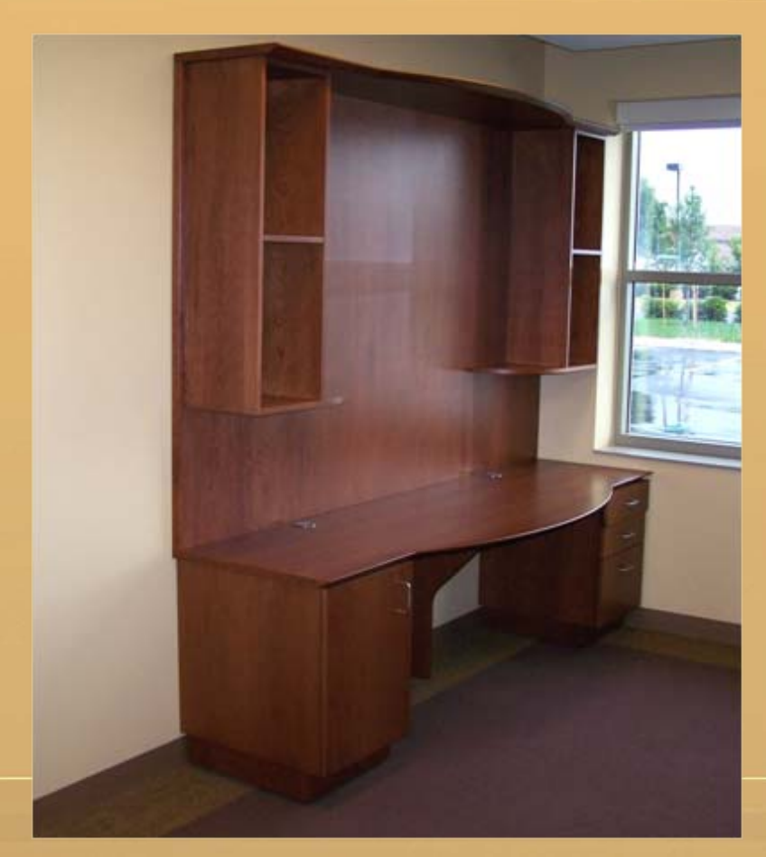
Personal Advisors Office