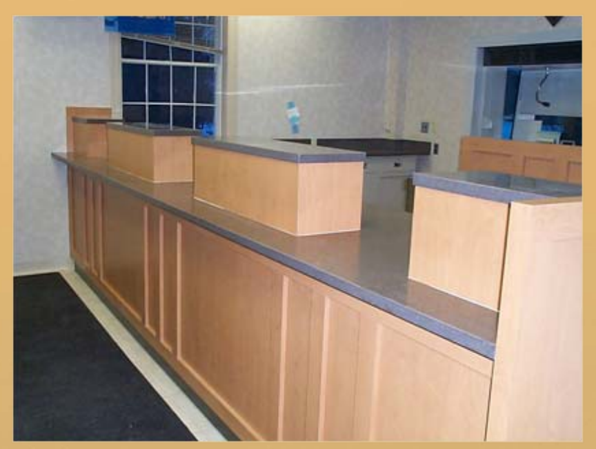
Teller Line - Customer Side