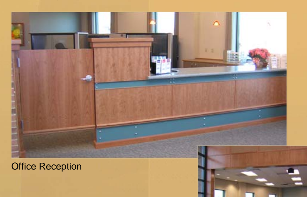
Lobby to Offices