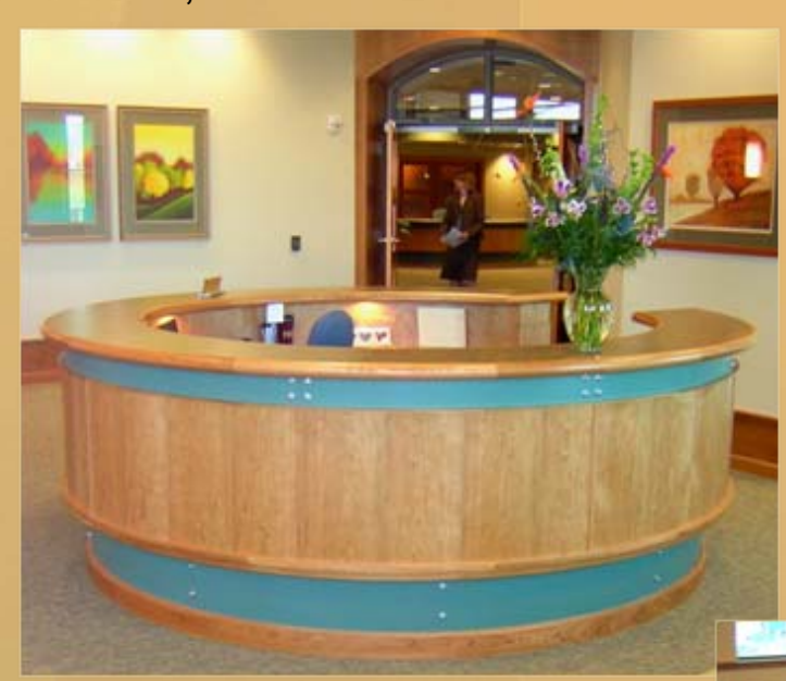
Reception - Second Floor