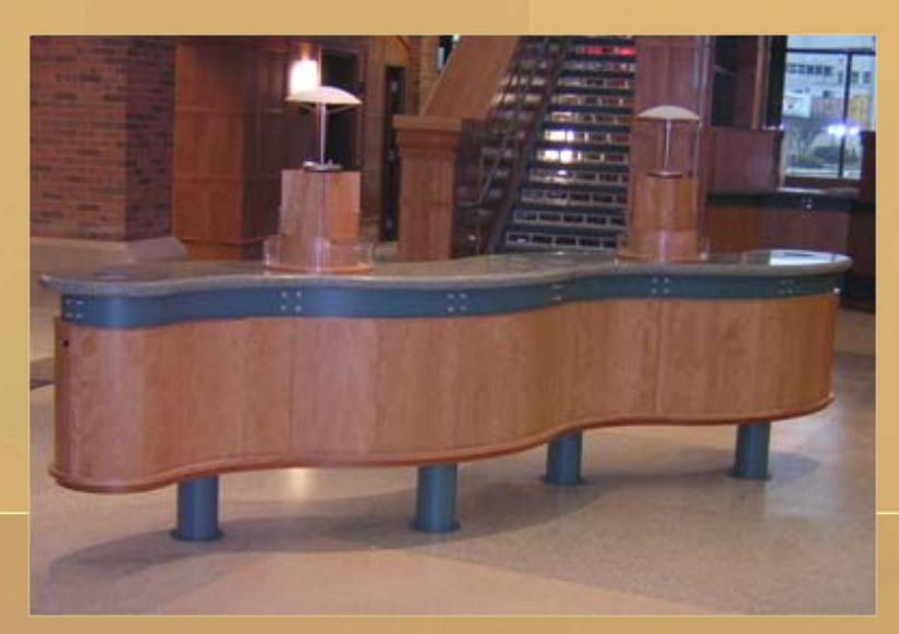
Check Writing Stand

All customer touch points in this credit union headquarters building carry the design concept through to completion. At HLF we take pride in our ability to design & produce to exact architectural specifications, resulting in a project that perfectly suits the needs of the client.