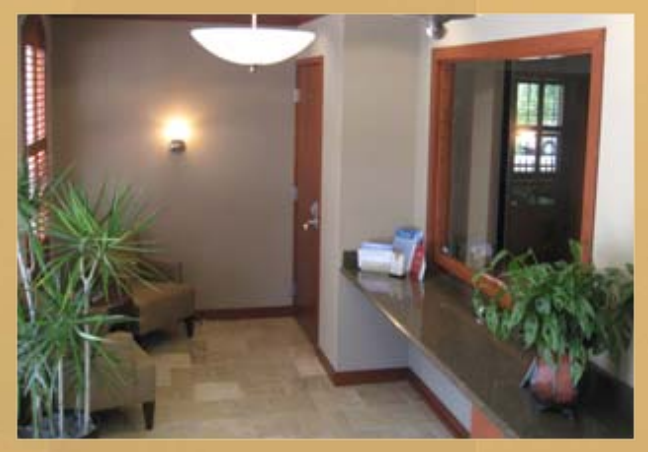
Lobby - Opposite

This full interior package showcases our ability to provide a singular solution to interior furnishings, millwork, casework, doors and trim anywhere in the country.