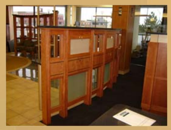
Internet Banking - Back

This unique design uses a different approach to banking, with a bold style and customer friendly atmosphere. Cherry, Silestone, Laminated Glass, and Integrated Technology all combine for the result you see.