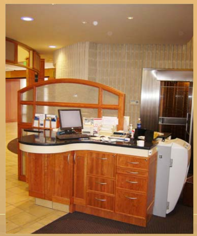
Dialogue Banking Station