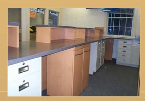
Teller Line - Teller Side