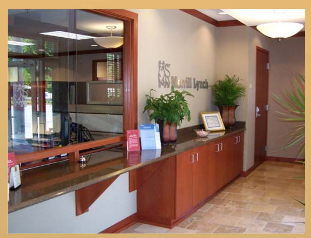
Lobby Veneer Casework, Pass Through Window, Door, Base & Crown