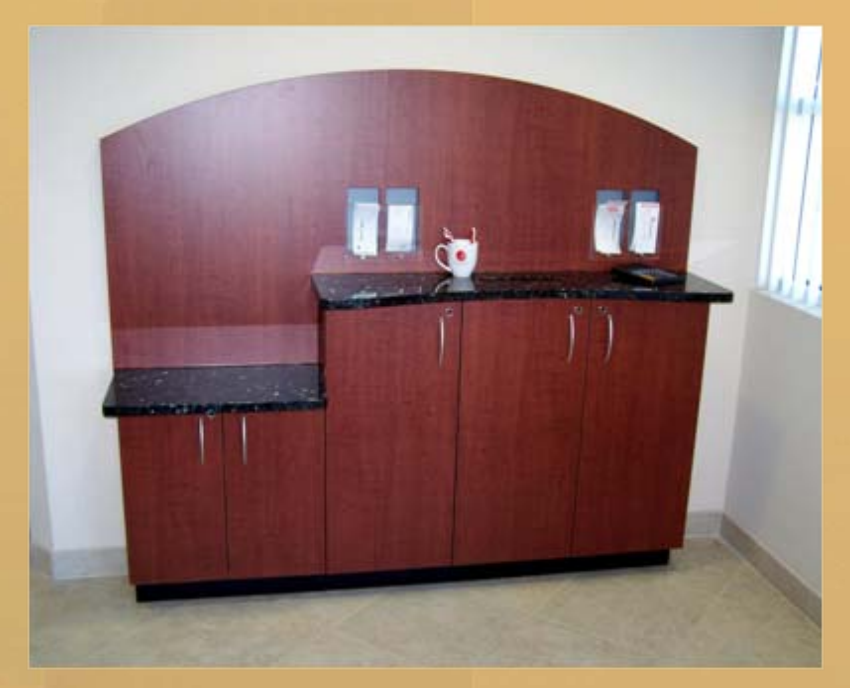
Coffee Bar with storage and brochure display