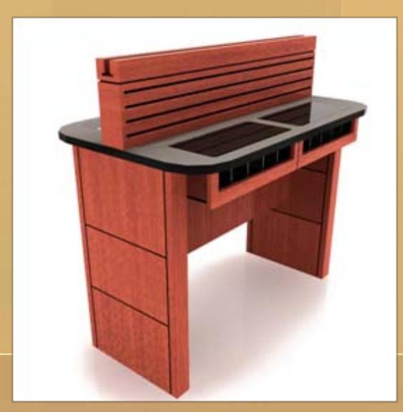
Double Sided Check Stand

The Advantage Branch line of modular banking furniture provides a turnkey solution to the banking industry. Ideal for boutique banks the prototypes are easily modified to suit your branding needs