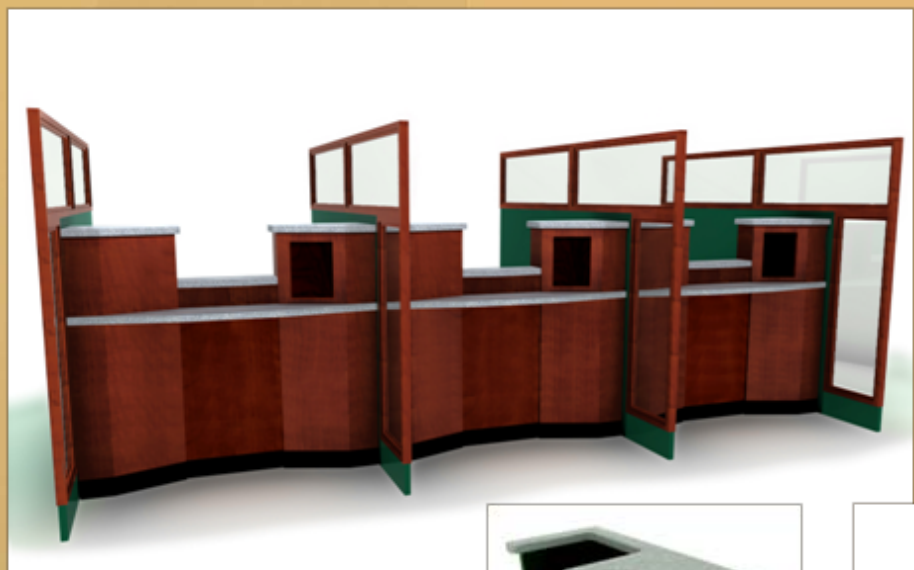
Teller Line – 3 Stations