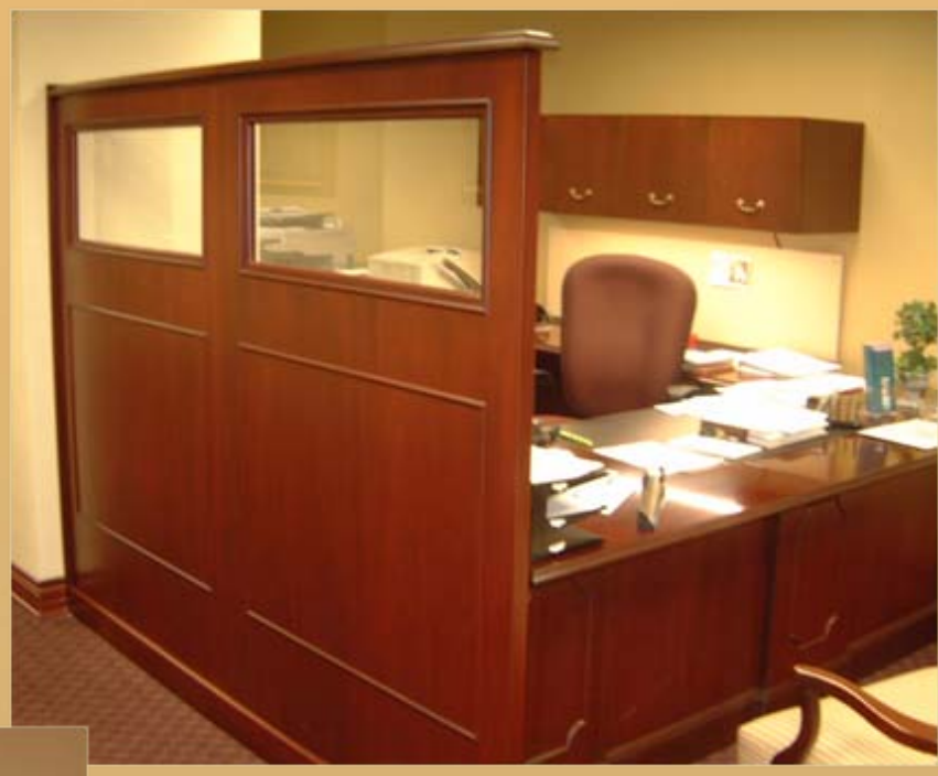
Office Desk with Return and Wall Storage