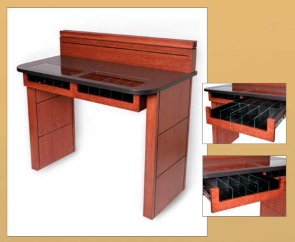
Single Sided Check Stand

Advantage Branch by HLF items have a wide variety of features and accessories that integrate electronics, ergonomics, privacy, marketing, and enhanced functionality.