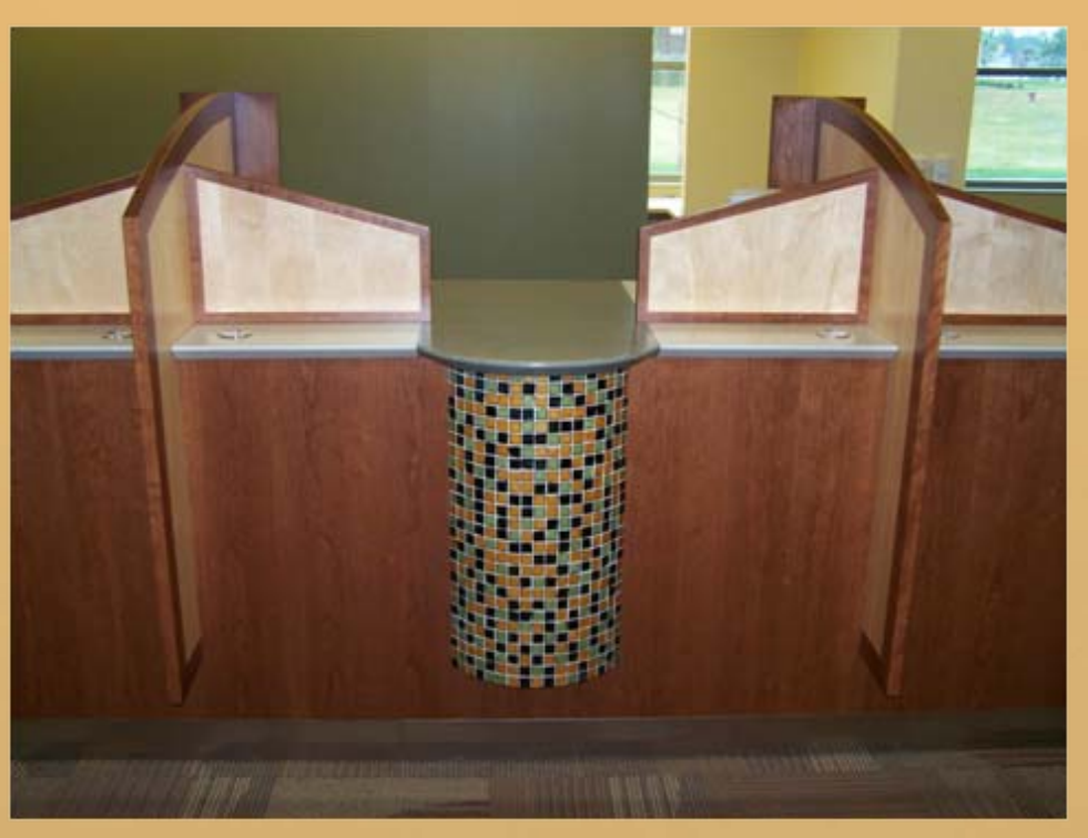
Teller Station – Customer Viewpoint