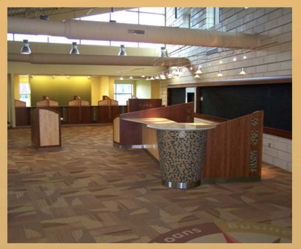
View from Entry