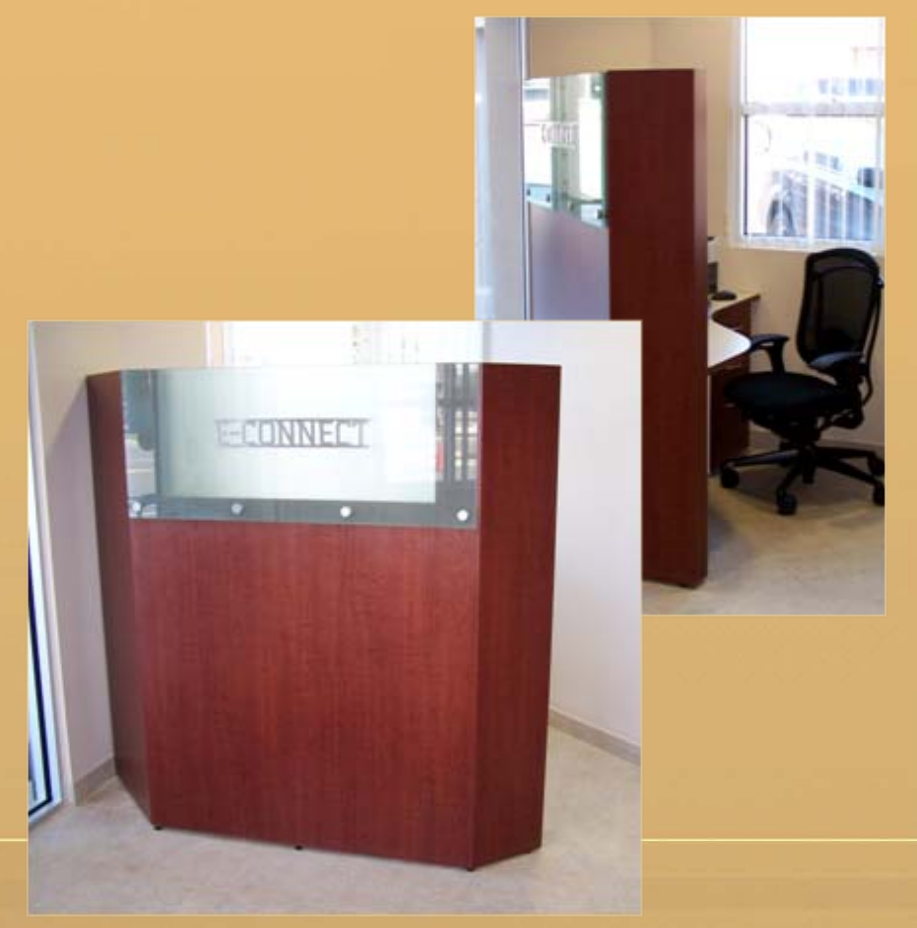
"E-CONNECT", Internet banking station