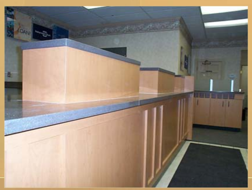
Teller Line - Customer Side

A more typical straight teller line in cost effective finishes, results in a comfortable and familiar banking environment.