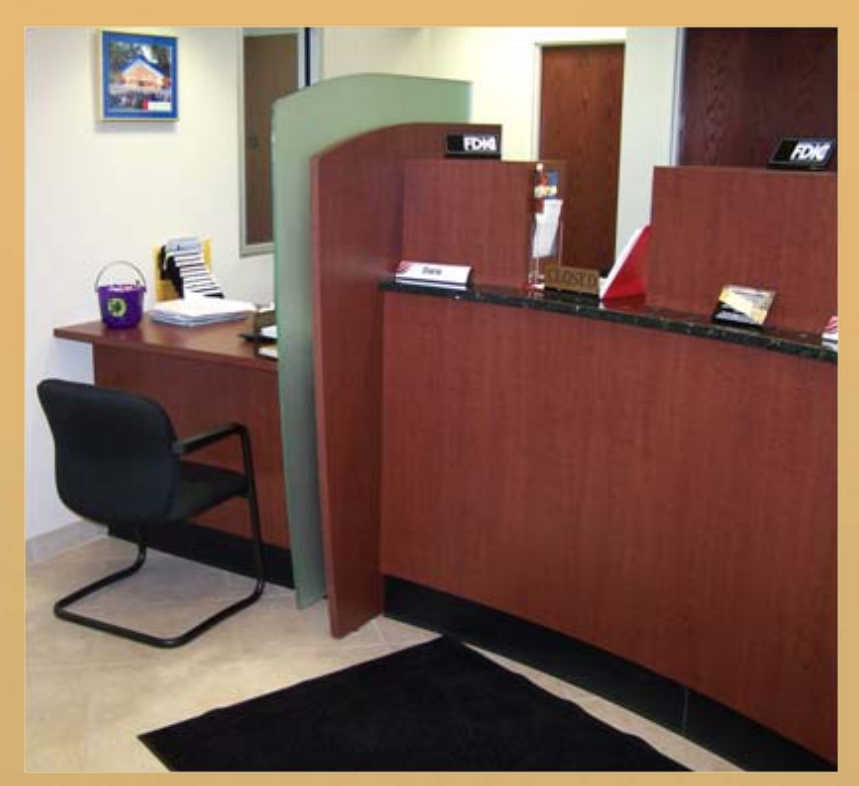
Teller Line with ADA station