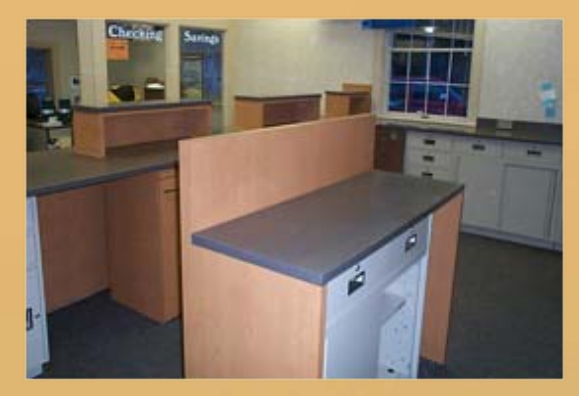
Teller Line - Teller Side