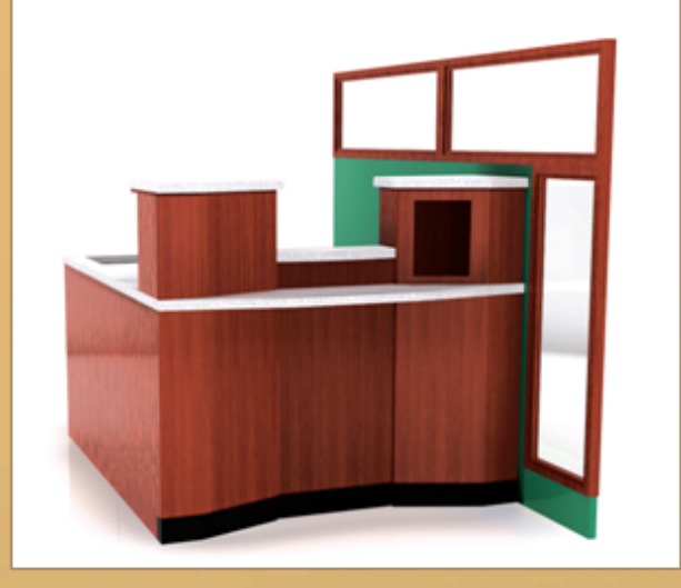
Teller Unit with Privacy Wall